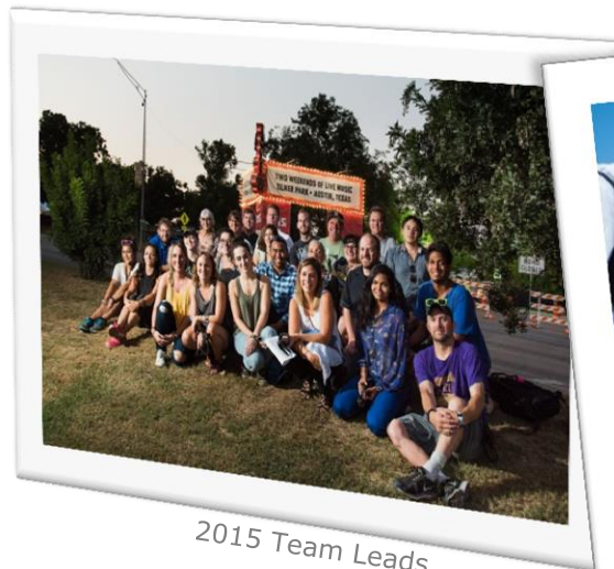
2015 Team Leads